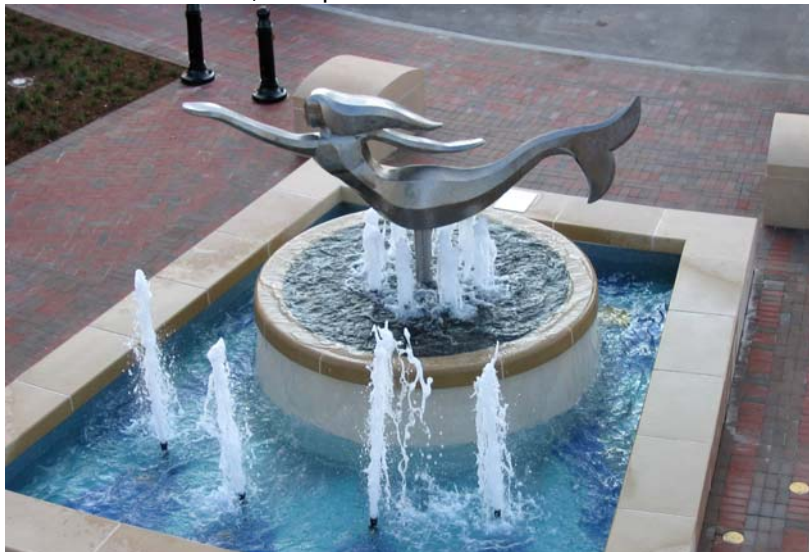
"NORFOLK MERMAID", 2009 TOWN POINT PARK – NORFOLK, VA