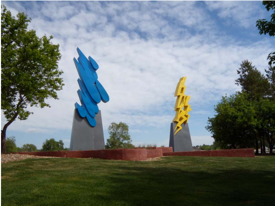
"WATER & POWER" SERVICE CENTER BUILDING CITY OF LOVELAND, CO

My work is primarily focused on the conveyance of metaphorical meanings that relate to universal themes such as balance, interdependence, and the human condition. I utilize technology to a great degree in the creation of my sculpture. I also seek to use more environmentally conscious materials and processes wherever possible. These sustainable and technological aspects are essential to artwork for public places, both in theme & practice. Dependant on the nature of each project, I employ durable materials such as stone, concrete, metal and glass. I find that the interplay between different media serves to accentuate the intrinsic qualities of each material. This juxtaposition adds another layer of interest to the total artwork placement.