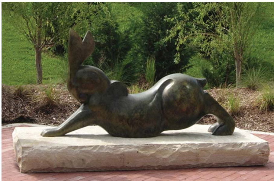
RABBIT REACH, CITY OF LITTLE ROCK, AR